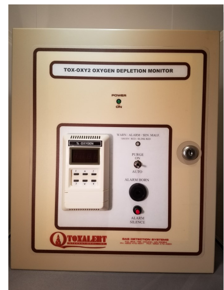
TOXOXY2 W/ Optional Display

The remote oxygen sensor(s) Model TOX-O2/1 is continuously monitored by the controller for sensor failure. If the sensor malfunctions, a visual alarm will activate.